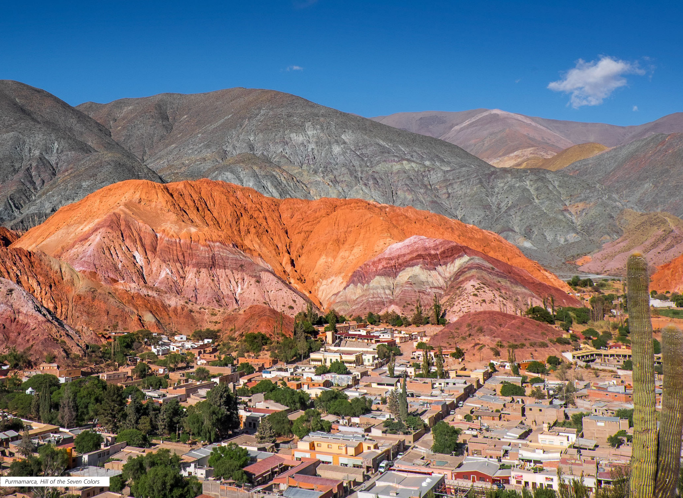
Purmamarca, Hill of the Seven Colors

Argentina is also famous for its great food and wine, and we will enjoy the finest local meals such as its delicious empanadas, and its famous sweets: alfajores and dulces de leche.