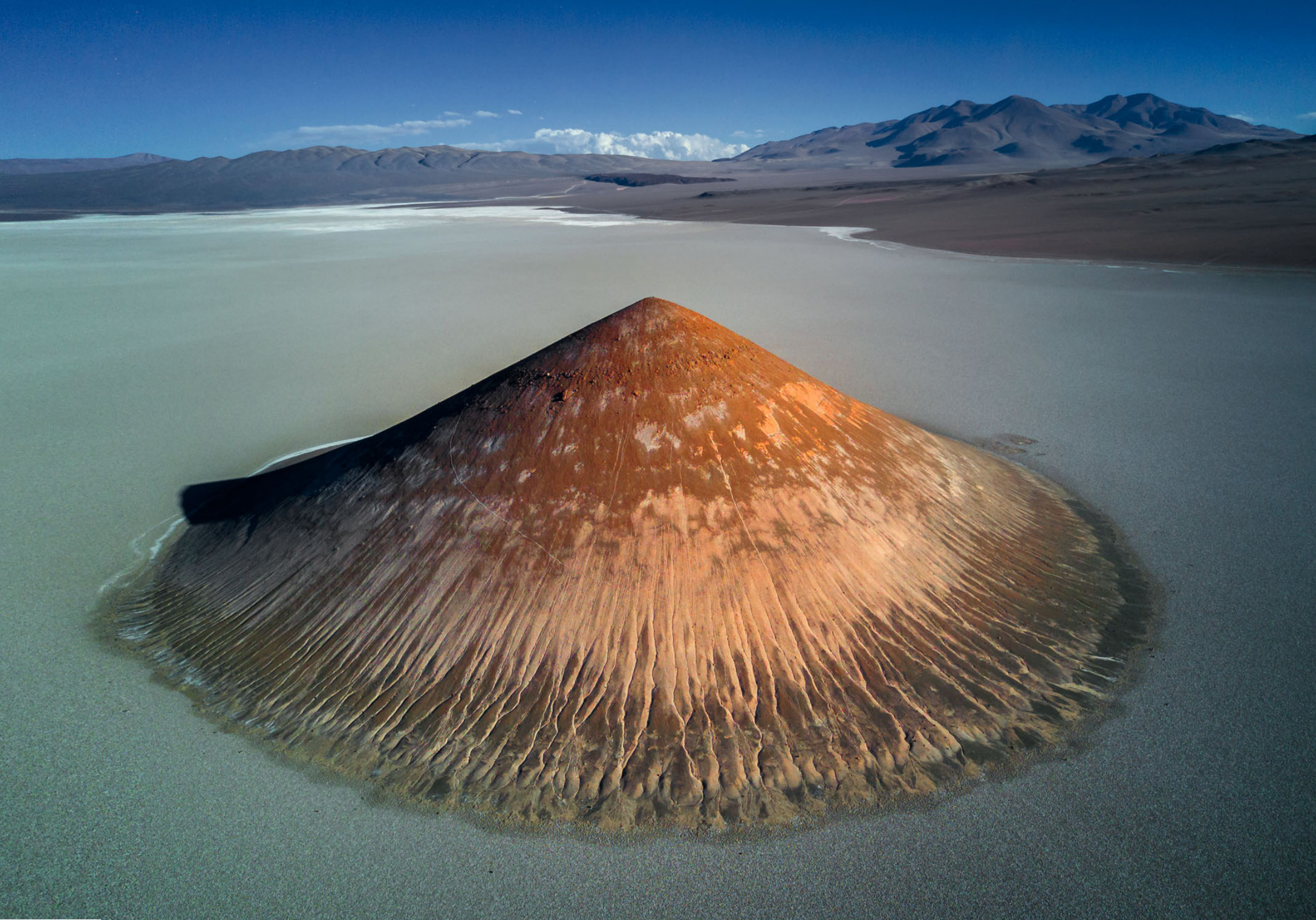
Cono de Arita

Night in Purmamarca, Hotel Marques de Tojo.