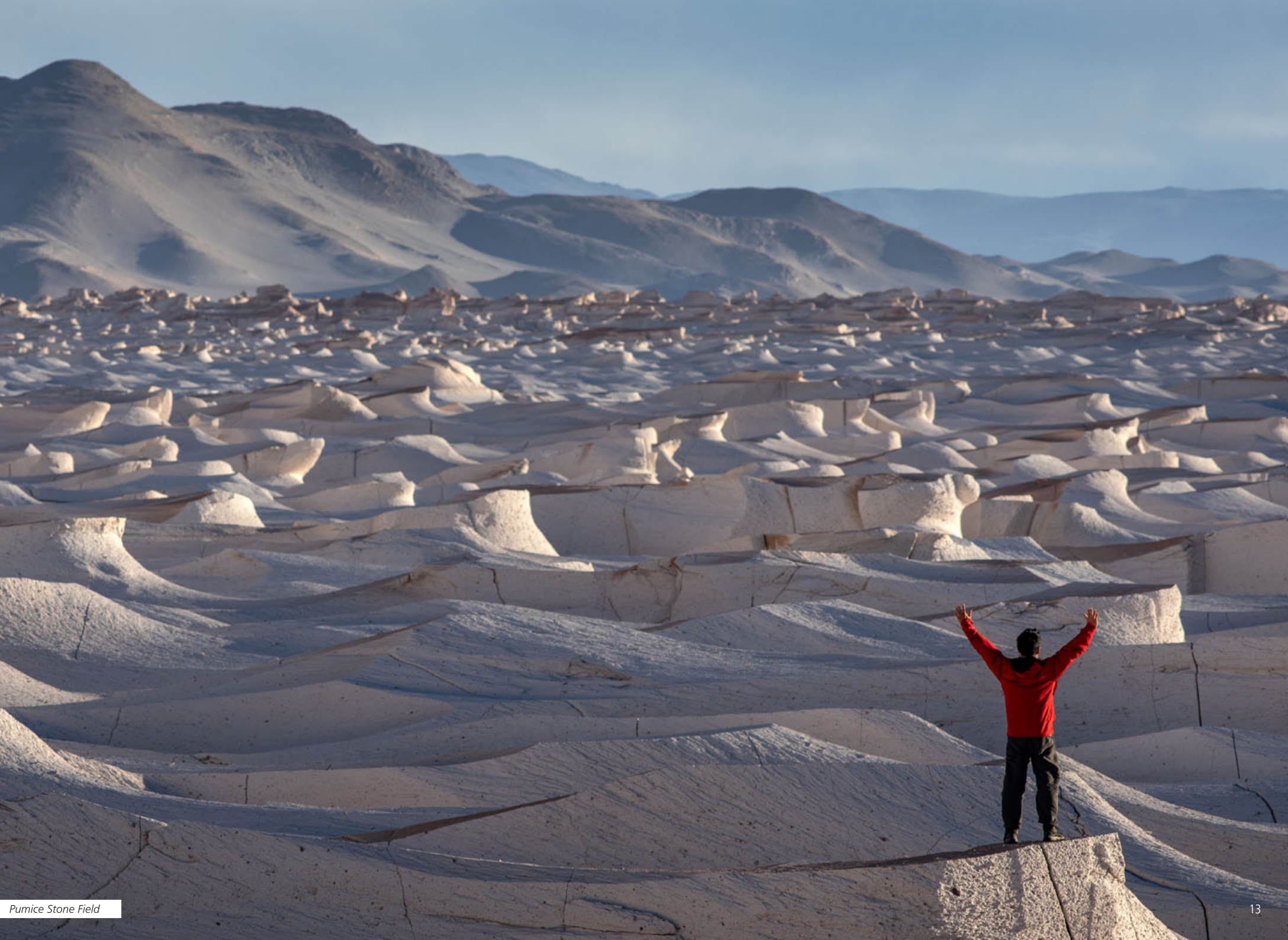
Pumice Stone Field