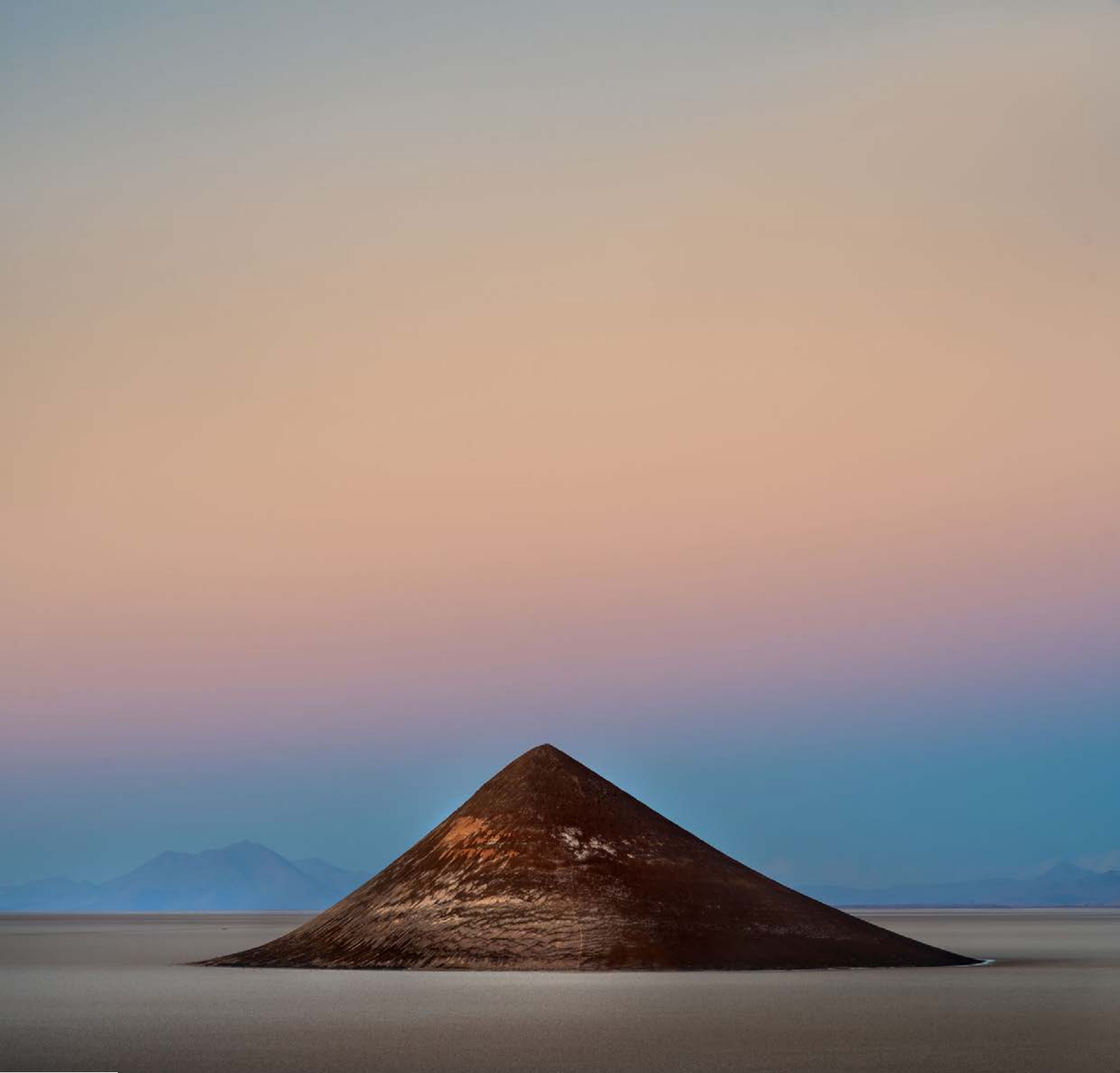
Cerro de Arita

To reserve your place for 2023 or to make an enquiry, please email ignacio@iptravelphotography.com.au