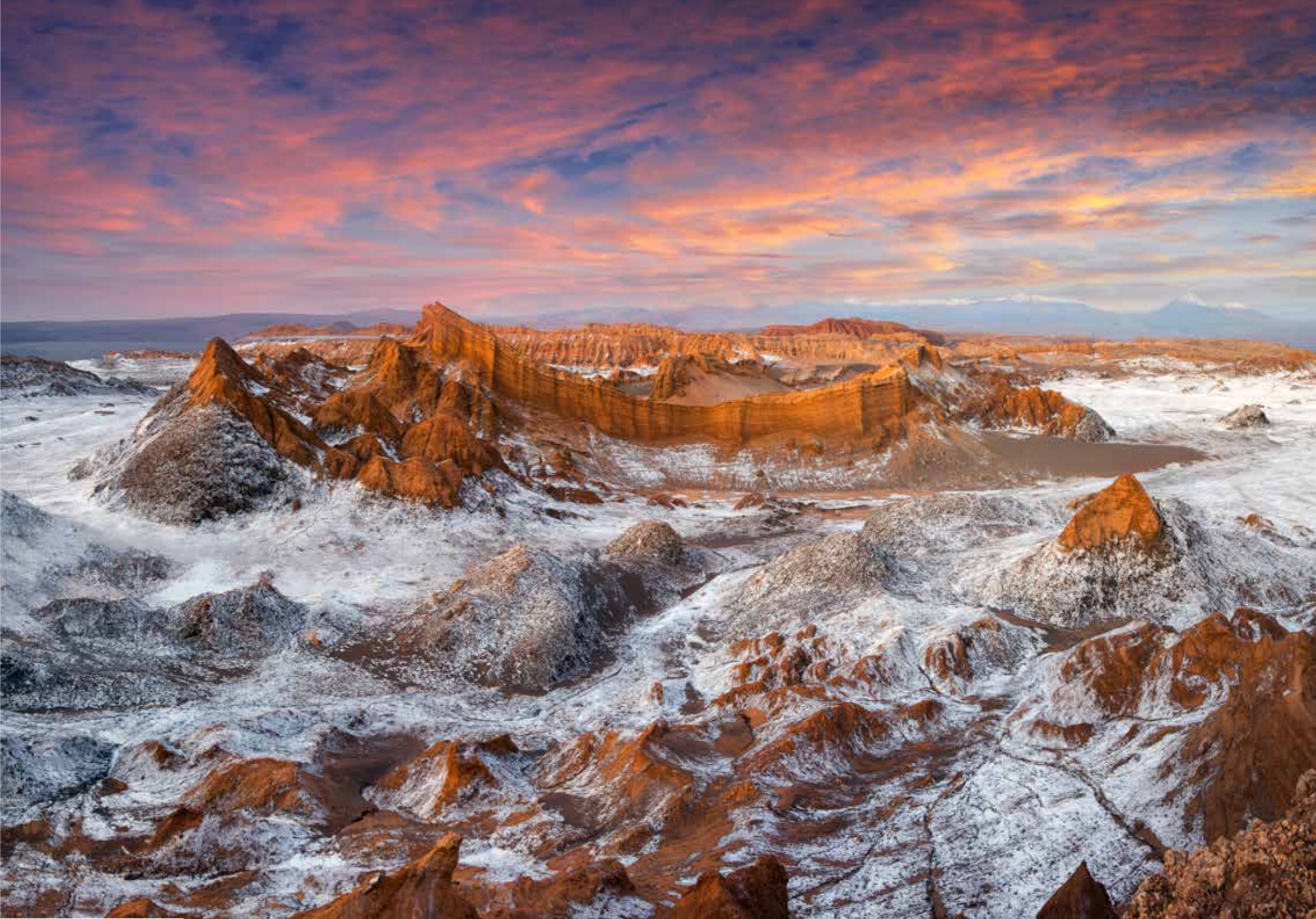
Achaches at sunset, Moon Valley

El Salar de Uyuni is an incredible place. It’s the world’s largest salt flat at an elevation of 3656 meters. The large area, clear skies, and the exceptional flatness of the surface make the Salar an ideal object for calibrating the altimeters of Earth observation satellites. At night, both the Atacama and the Altiplano are amazing locations to do some astrophotography, as the air quality is just superb.