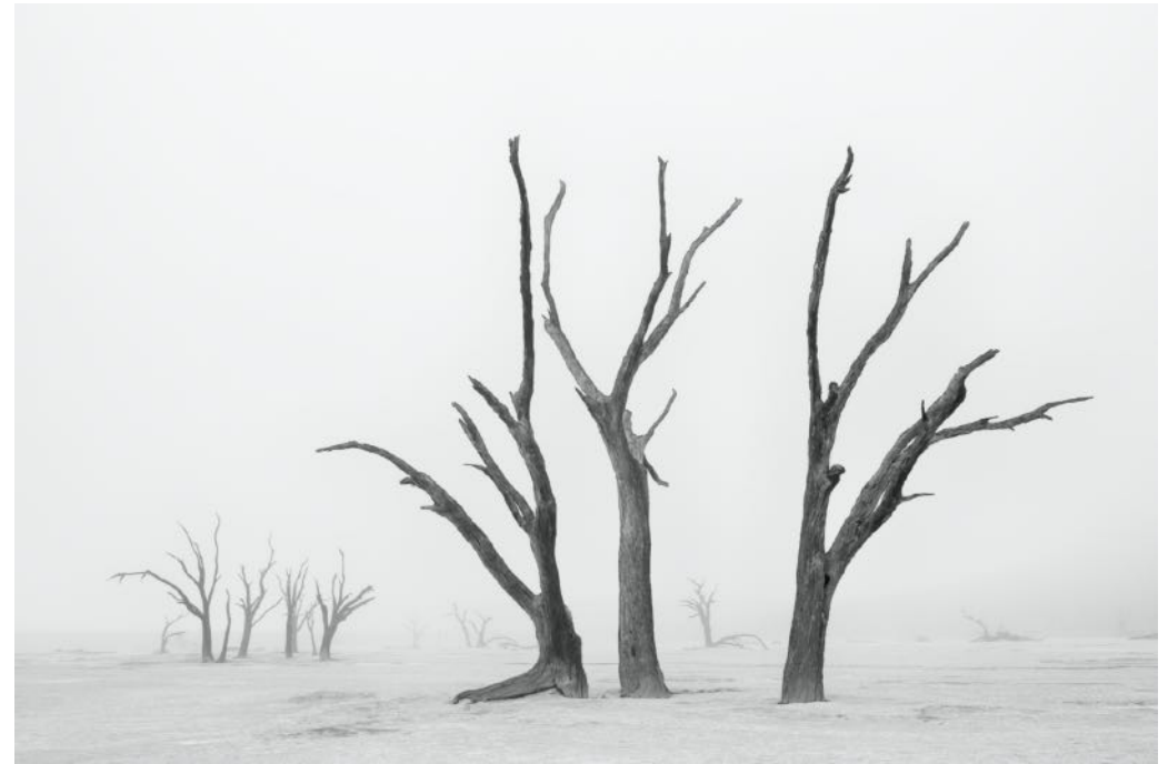
Dead camel thorn trees in rare foggy conditions in Deadvlei. This series won First Prize in the Travel Photographer of the Year.