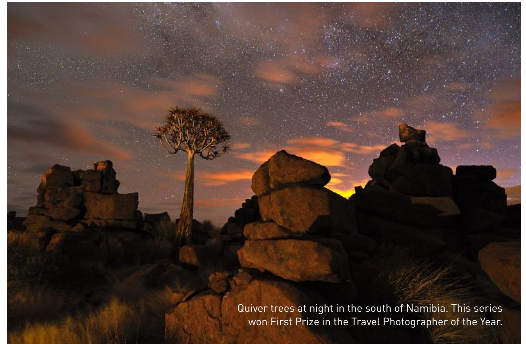
Quiver trees at night in the south of Namibia. This series won First Prize in the Travel Photographer of the Year.