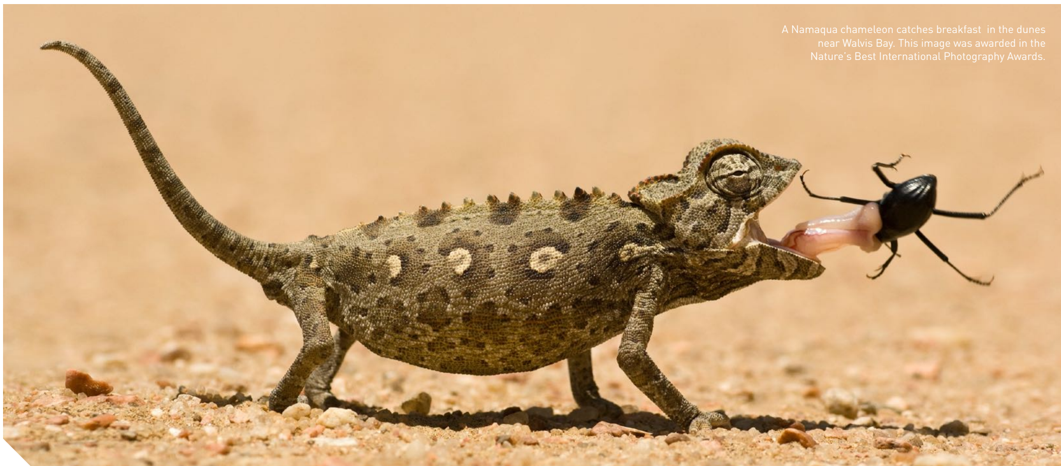
A Namaqua chameleon catches breakfast in the dunes near Walvis Bay. This image was awarded in the Nature's Best International Photography Awards.