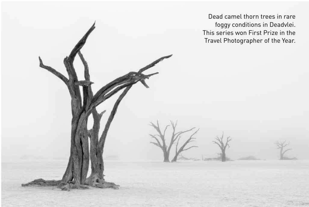
Dead camel thorn trees in rare foggy conditions in Deadvlei. This series won First Prize in the Travel Photographer of the Year.