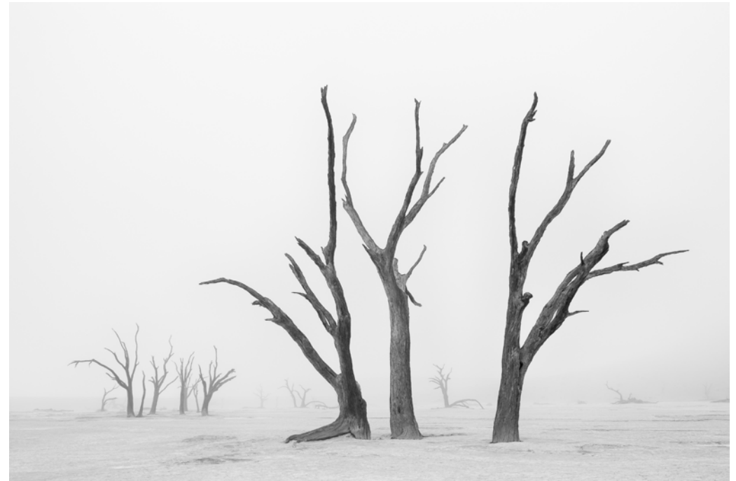
Dead camel thorn trees in rare foggy conditions in Deadvlei. This series won First Prize in the Travel Photographer of the Year.