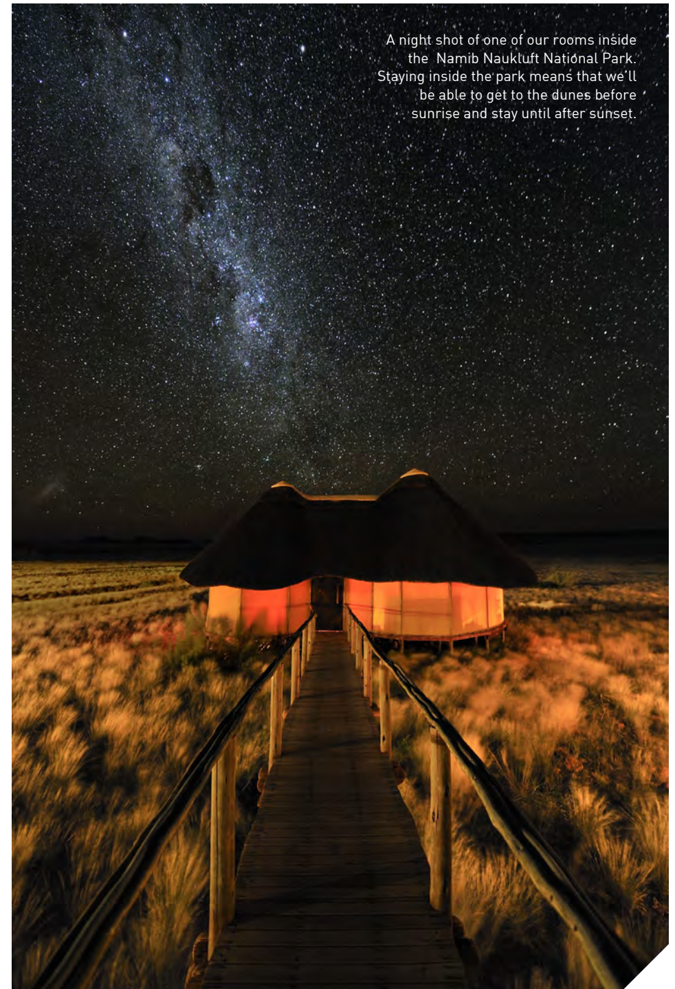
A night shot of one of our rooms inside the Namib Naukluft National Park. Staying inside the park means that we'll be able to get to the dunes before sunrise and stay until after sunset.

Namibia now boasts the largest free-roaming population of black rhinos and cheetahs in the world and is the only country with an expanding population of free-roaming lions. Namibia's elephant population more than doubled between 1995 and 2008 from 7,500 to over 16,000 individuals.