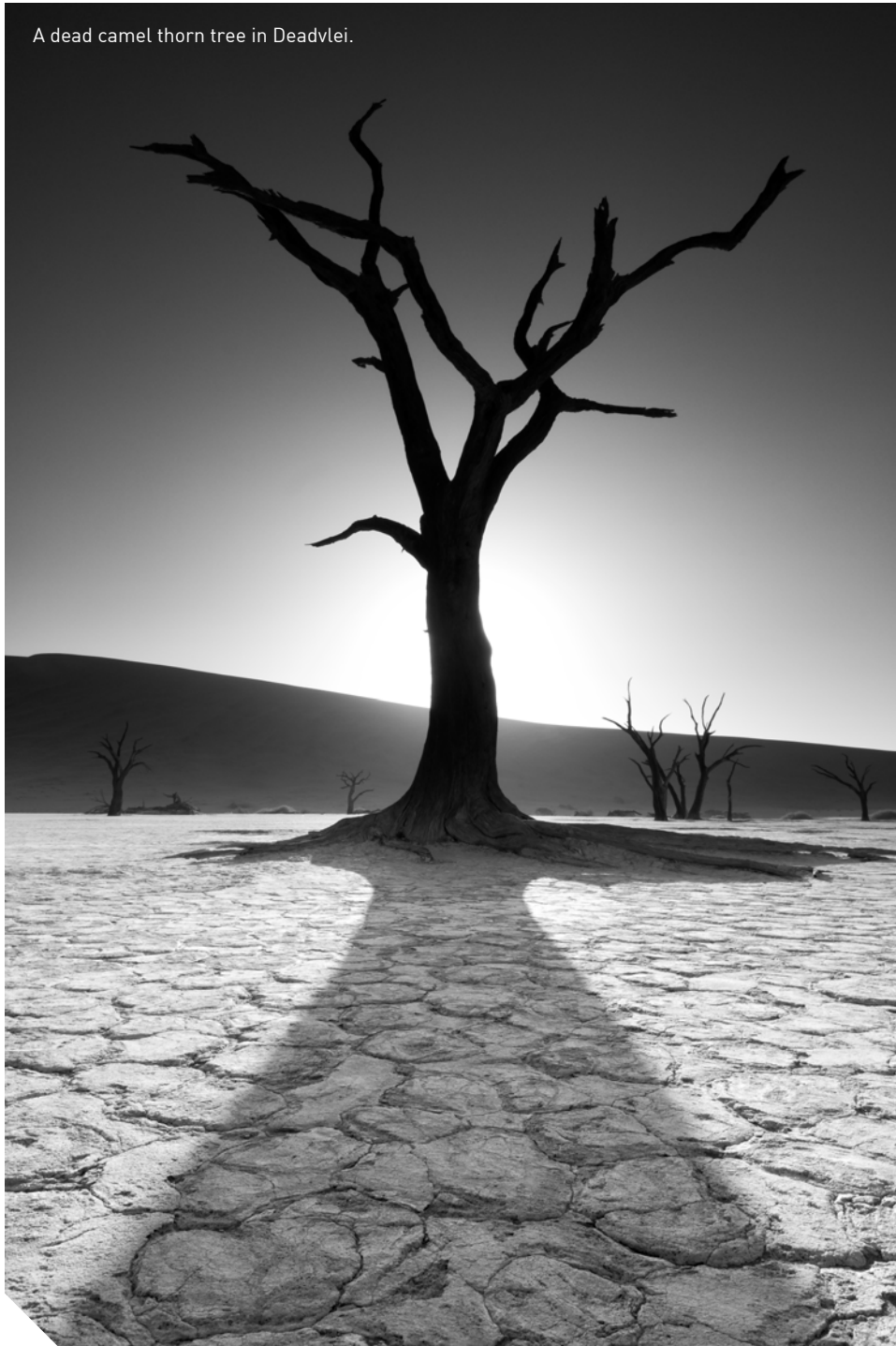
A dead camel thorn tree in Deadvlei.