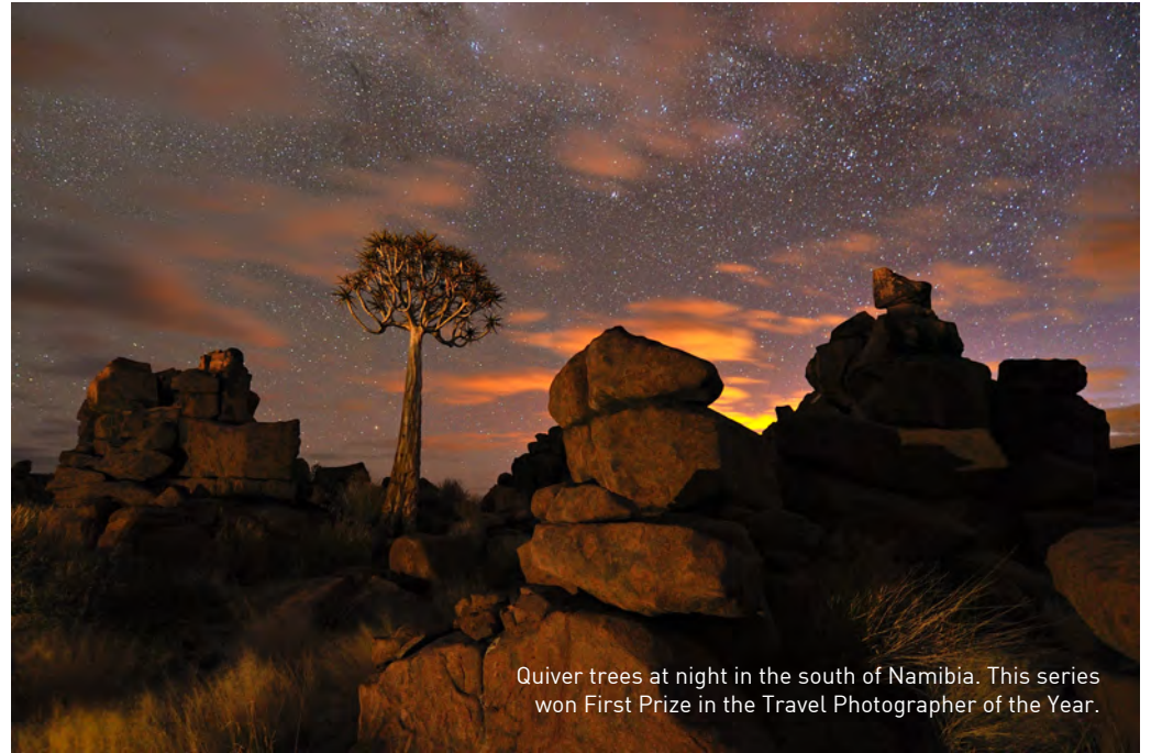
Quiver trees at night in the south of Namibia. This series won First Prize in the Travel Photographer of the Year.