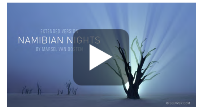
'Namibian Nights'. Time-lapse video that won First Prize in the Travel Photographer of the Year. Click to view.