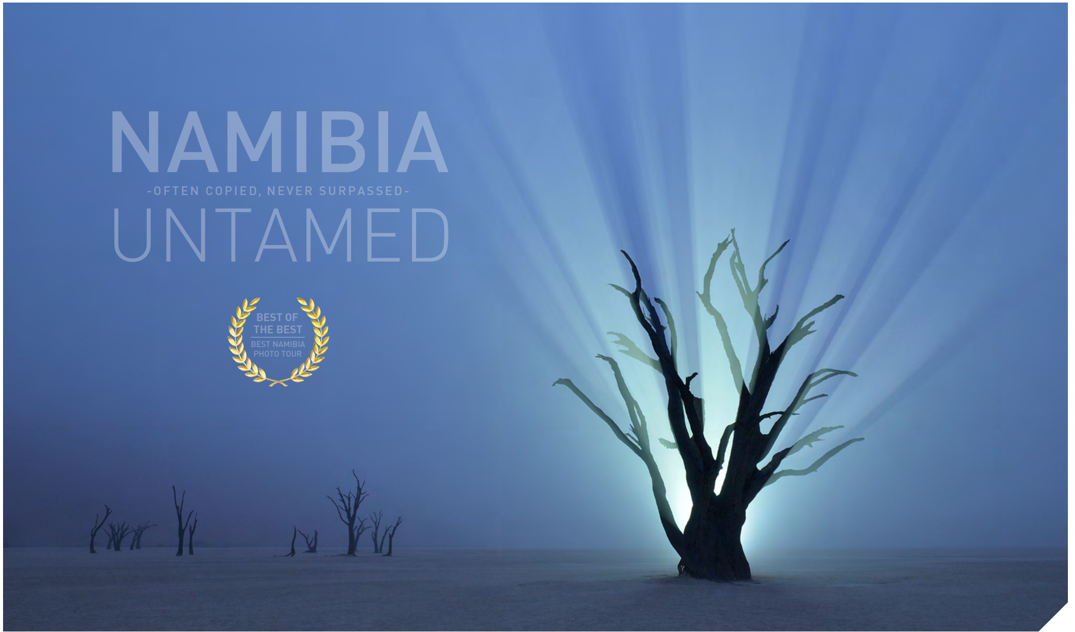
'Resurrection,' winner in the Wildlife Photographer of the Year competition.