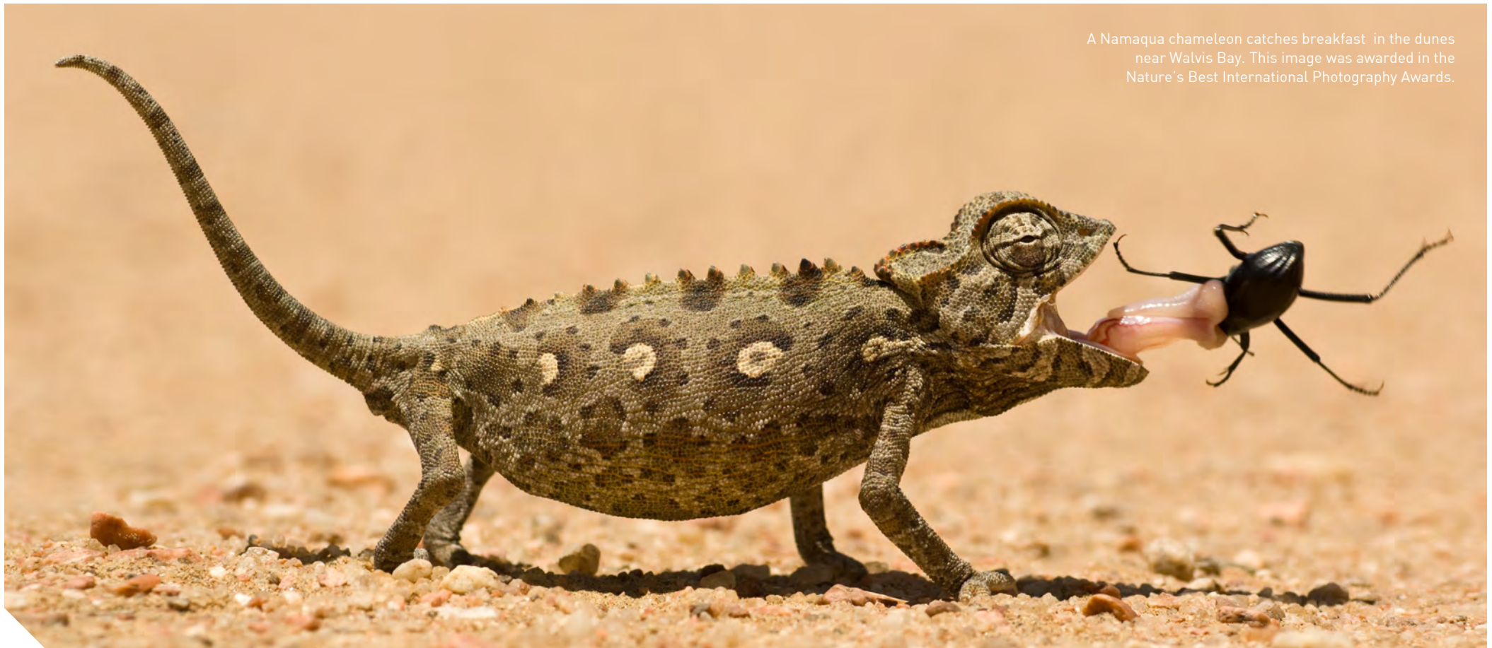
A Namaqua chameleon catches breakfast in the dunes near Walvis Bay. This image was awarded in the Nature's Best International Photography Awards.