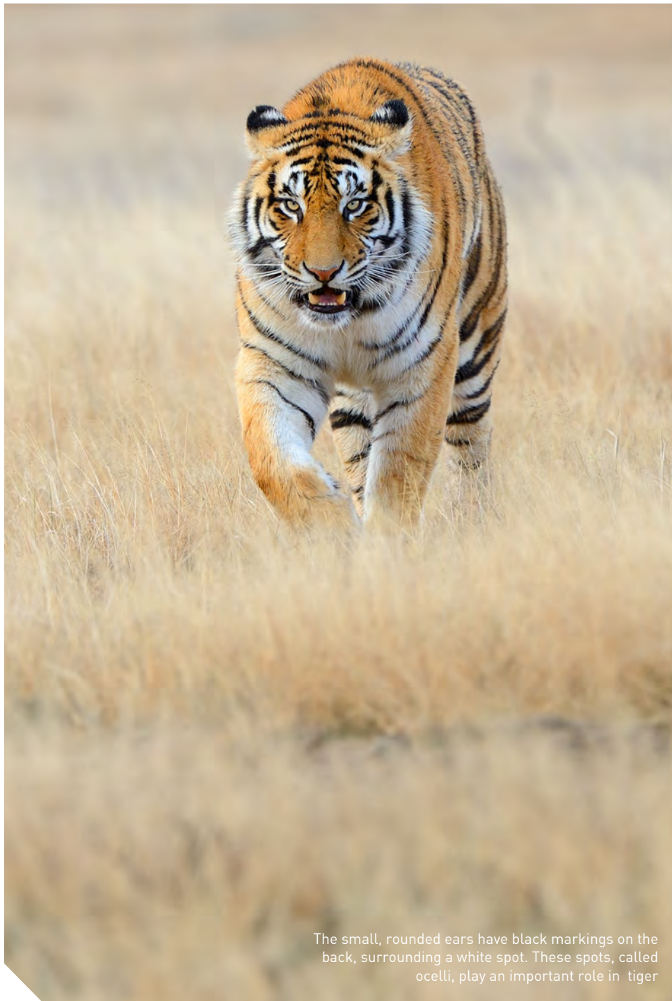
The small, rounded ears have black markings on the back, surrounding a white spot. These spots, called ocelli, play an important role in tiger