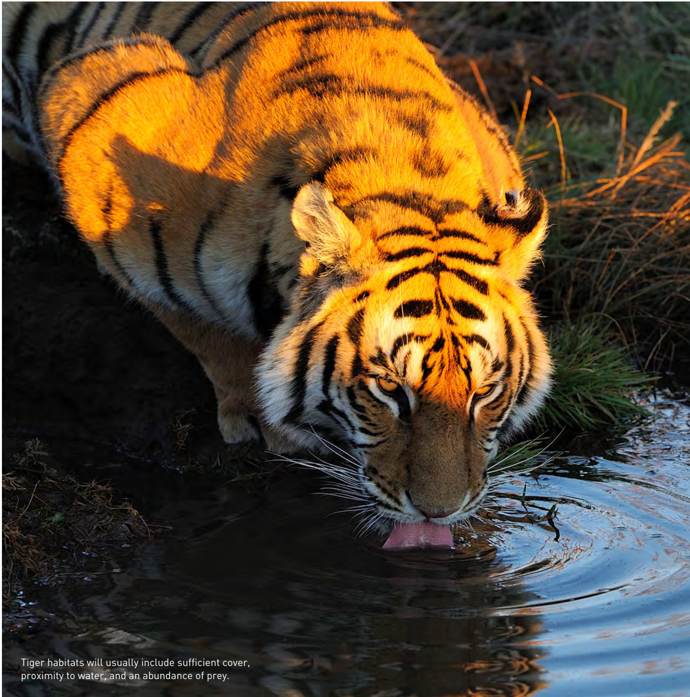
Tiger habitats will usually include sufficient cover, proximity to water, and an abundance of prey.