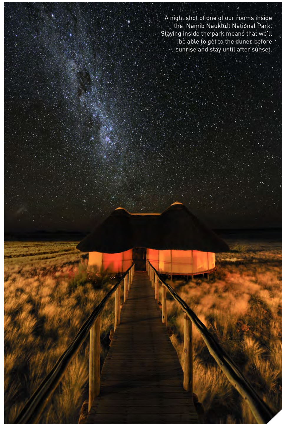
A night shot of one of our rooms inside the Namib Naukluft National Park. Staying inside the park means that we'll be able to get to the dunes before sunrise and stay until after sunset.

Namibia now boasts the largest free-roaming population of black rhinos and cheetahs in the world and is the only country with an expanding population of free-roaming lions. Namibia's elephant population more than doubled between 1995 and 2008 from 7,500 to over 16,000 individuals.