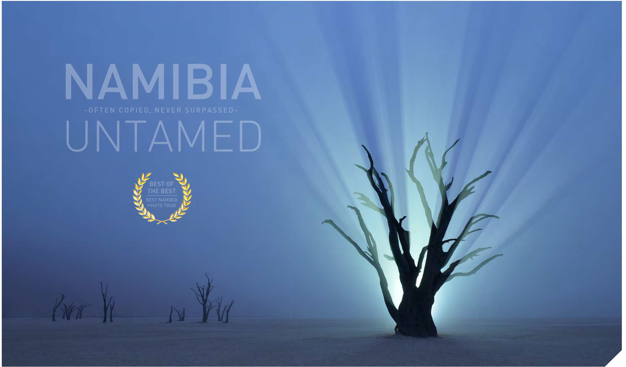
'Resurrection,' winner in the Wildlife Photographer of the Year competition.