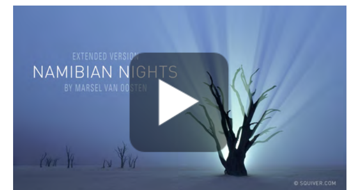
'Namibian Nights'. Time-lapse video that won First Prize in the Travel Photographer of the Year. Click to view.