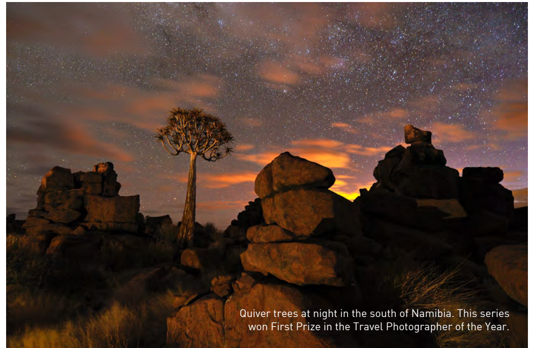
Quiver trees at night in the south of Namibia. This series won First Prize in the Travel Photographer of the Year.